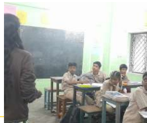
NMMS Special class