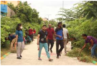
Urban Forest- Plantation + Maintenance

We were able to conduct various events both on field and virtually.