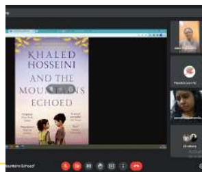
Read & Reveal