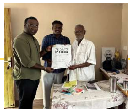
Thiru. Nallakannu , Indian Political leader

Besides releasing the calendar, the encouragement each of the dignitaries gave us, motivated to doing more for. Apart from the dignitaries, our volunteers too released some calendars, which was delightful, as they played the crucial role in the campaign.