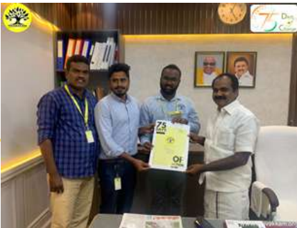
Honorable Minister Thiru. Siva. V. Meyyanathan , Department of Environment and Climate Change, Government of Tamil Nadu