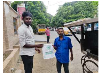
Thanking our Helpers in Society

All had been possible only because of our volunteers, various partners including our refreshment partner McRennette and our team, who were supportive throughout.