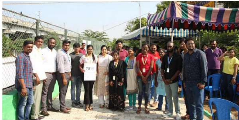
Thuvakkam has been involved in relief causes like disaster aid, social awareness through street plays.

Published: 21st September 2022 06:56 AM | Last Updated: 21st September 2022 01:19 PM