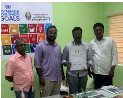
Mr. Dhamodharan, Commissioner , Kundrathur Municipality, Government of Tamil Nadu